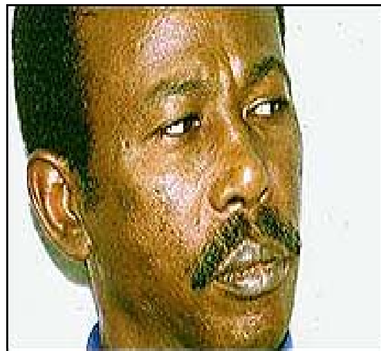
Faces of evil.